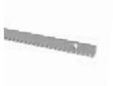
ROA8 M4 rack, 30x8x1000mm, zinc coated with spacers and screws