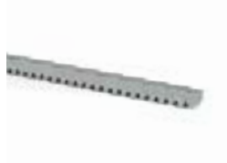
ROA7 M4 rack, zinc coated, 22x22x1000mm