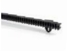
L05 plastic rack 26x26x500mm, for gates weighing up to 400kg