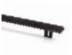
ROA6 M4 25x20x1000mm slotted nylon rack with metal insert