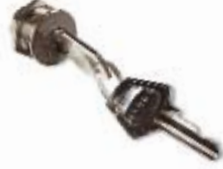
CM-B lock with two metal keys compatible with SELE